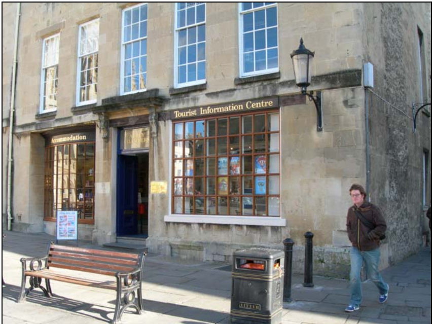
TOURIST INFORMATION CENTRE

Throughout the hunt you will see extra information marked with a treasure map. Whilst this does not form part of the instructions it is intended to make your journey more interesting. Any detours you make to explore the surrounding sights en route should be retraced before continuing the hunt where you left off.