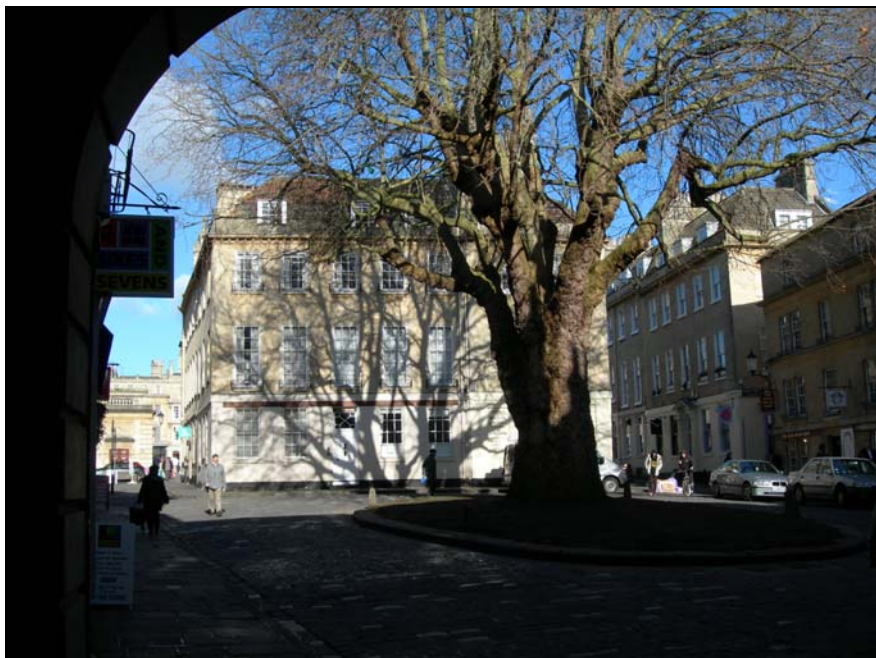
VIEW THROUGH ARCHWAY

We follow the road as it bends through the archway.