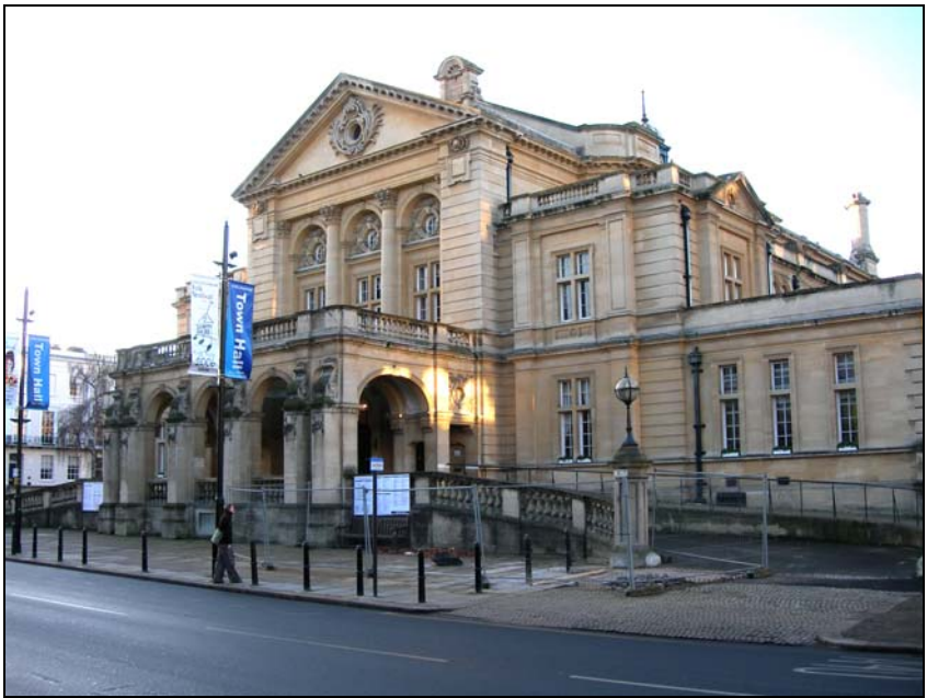
THE PUMP ROOM